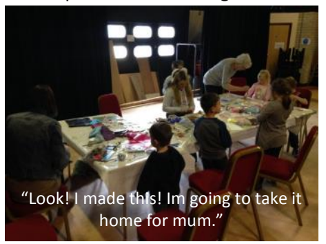
Easter Saturday Activities in Rohayader Nuiseut and Gallery is the Elan Valley Visitor Centre th April Ey Indi for 5-10 per Cell Webder for - Ipal Inte Mastar Eday

"That was great fun, thank you so much ... we've come back a second time as the kids are loving it so much"