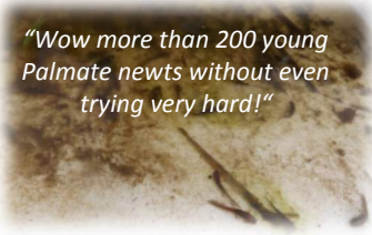
"Wow more than 200 young Palmate newts without even trying very hard!"

During the afternoon session Scott led a walk to the Forest School, the children walked mindfully taking in the environment with all their senses, and were totally immersed in the task of discovering more about the natural world around them.